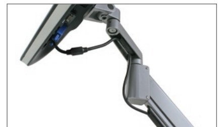
Integrated cable management