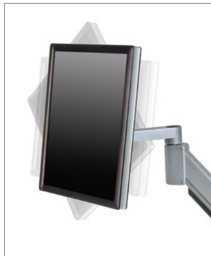
Monitor pivots from landscape to portrait