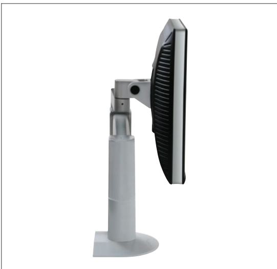
Folds to save maximum space